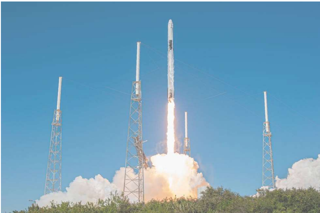
Dec 5, 2019 SpaceX Falcon 9 rocket launch https://www.nasa.gov/launchschedule

» The launch site is in Florida, so earthquakes and volcanoes are not around, but water and weather hazards sure are.