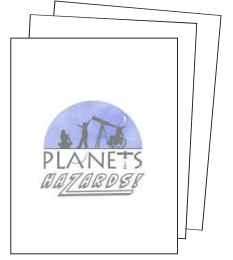
Page 2 (right)